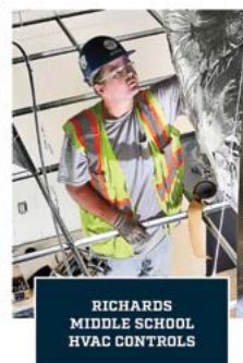
RICHARDS MIDDLE SCHOOL HVAC CONTROLS