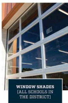
WINDOW SHADES (ALL SCHOOLS IN THE DISTRICT)

For more information about the 2023 bond and upcoming projects, please visit our bond website .