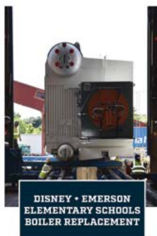
DISNEY • EMERSON ELEMENTARY SCHOOLS BOILER REPLACEMENT